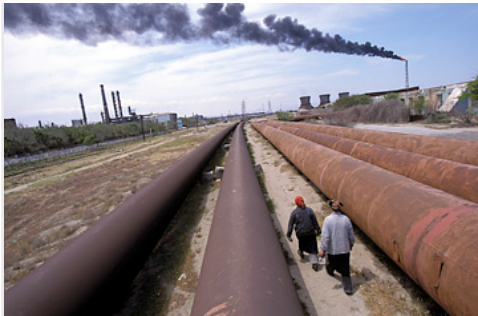
The industrial zone in Sumgayit, Azerbaijan.