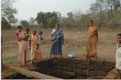
Women draw water from a well. Groundwater in Sukinda is believed to be contaminated with chromium.