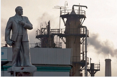
The Kaprolaktam Plant of the Sibur-Neftekhim joint stock company in Dzerzhinsk, Russia.