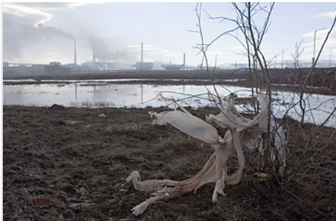
The Nadezhda nickel smelter pumps smoke over a pool of industrial water near Norilsk.