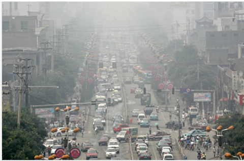
Smog covers the city center of Linfen.