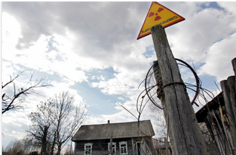
An abandoned house in the exclusion zone around the Chernobyl nuclear reactor.