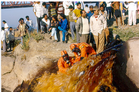
Greenpeace activists collecting samples of effluents being released into the Damanganga river from the Vapi Industrial area.